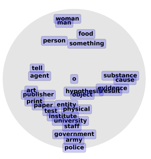
Figure 3: Wording embedding from 2D Poincaré event encoder